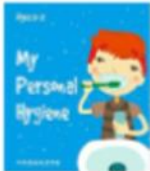
My Personal Hygiene