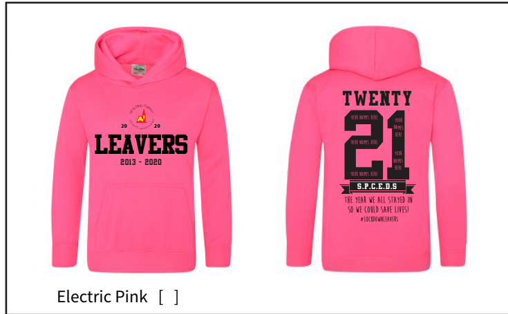
Electric Pink [ ]