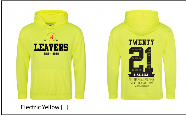
Electric Yellow [ ]