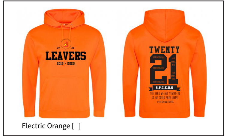
Electric Orange [ ]