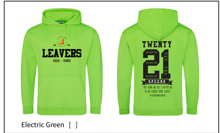
Electric Green [ ]