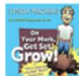
On Your Mark, Get Set, Grow!