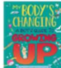
A Boy's Guide To Growing Up