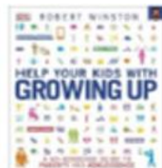
Helping Your Kids with Growing Up