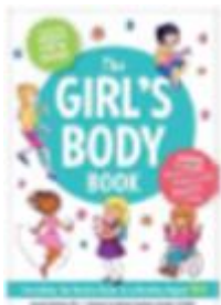
The Girl's Body Book