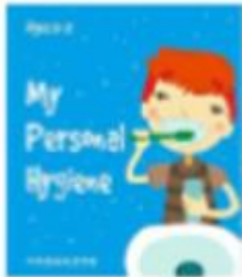
My Personal Hygiene