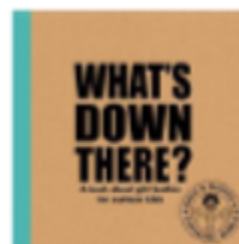
What's Down There?